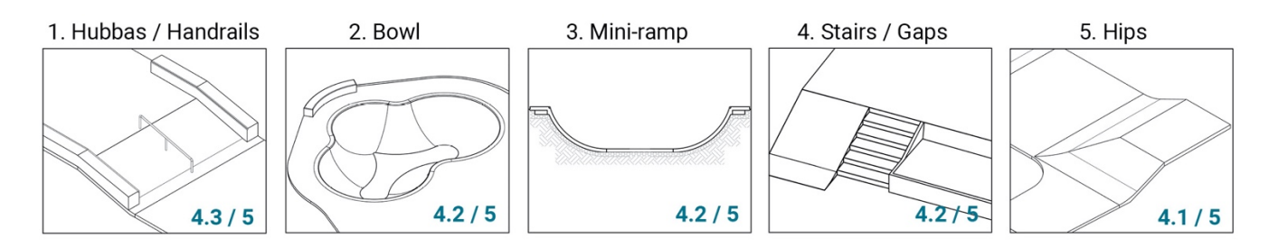
Top 5 Features as Rated Overall:

In determining the general priorities of future skatepark users, participants were asked to rank the importance of a series of potential skatepark features. The results are demonstrated below: